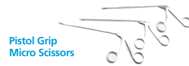
Pistol Grip Micro Scissors