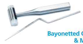
Bayonnetted Chisel & Mallet