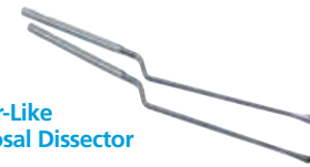
Spear-Like Mucosal Dissector