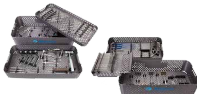
07-200-01MA – Tray 1 (Opening) 07-200-02MA – Tray 2 (Operating & Closing)