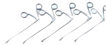
Assorted Cup Forceps