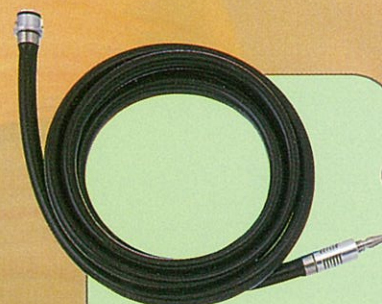
▲01-460-00 Pressure Supply Hose